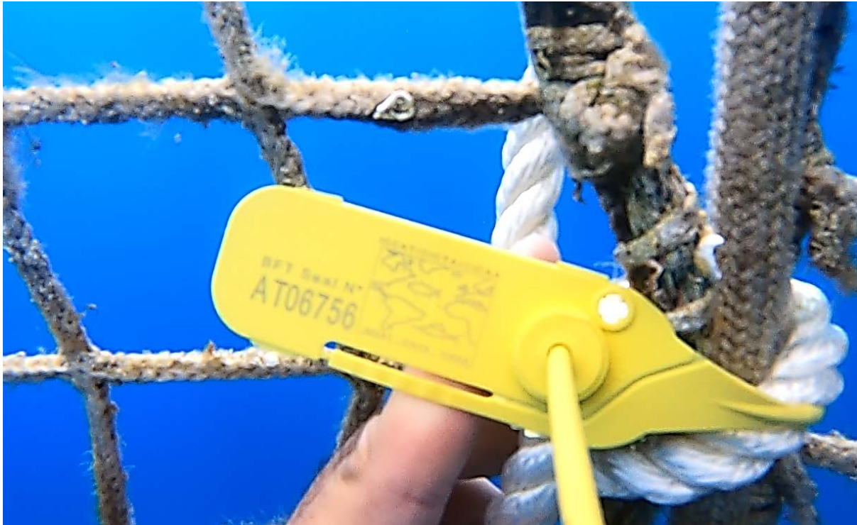
Figure 2: Screenshot of cage seal during sealing operation,