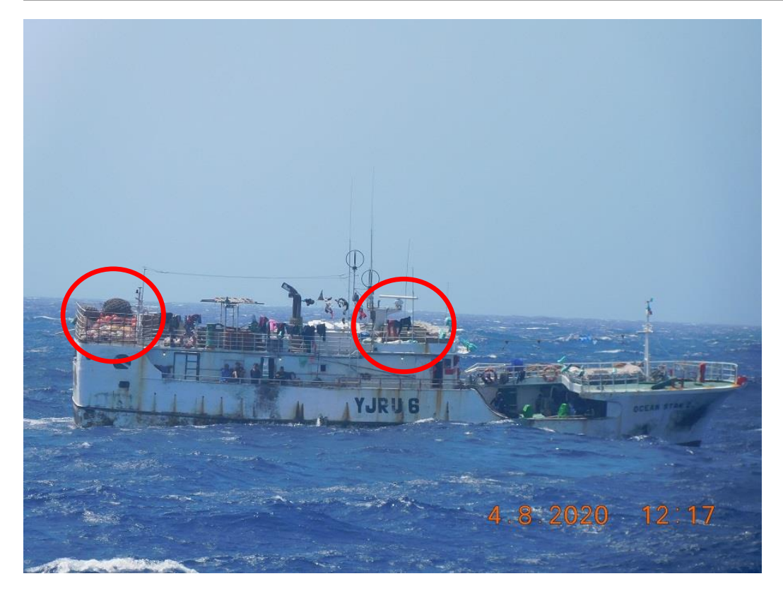
Figure (B) USCG Photograph of FV OCEAN STAR NO 2 during the patrol on 8 April 2020. The red circle identifies longline fishing gear observed on the decks of the vessel.