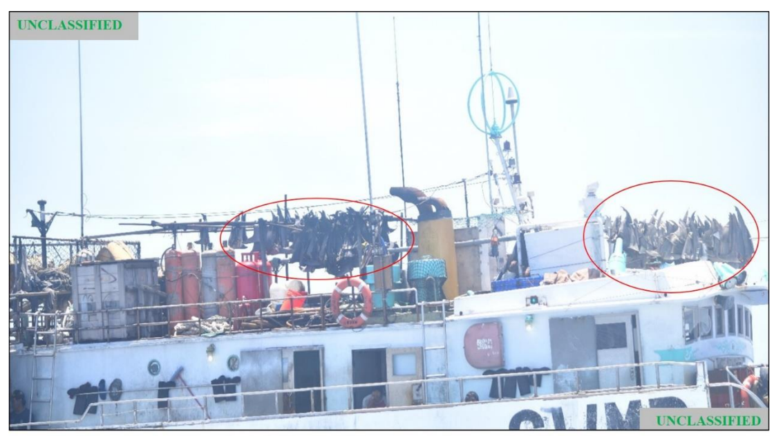
Figure (C) USCG Photograph of FV MARIO NO 11 during the patrol 6 May 2020. The red circle highlights the shark fins hanging above the decks.