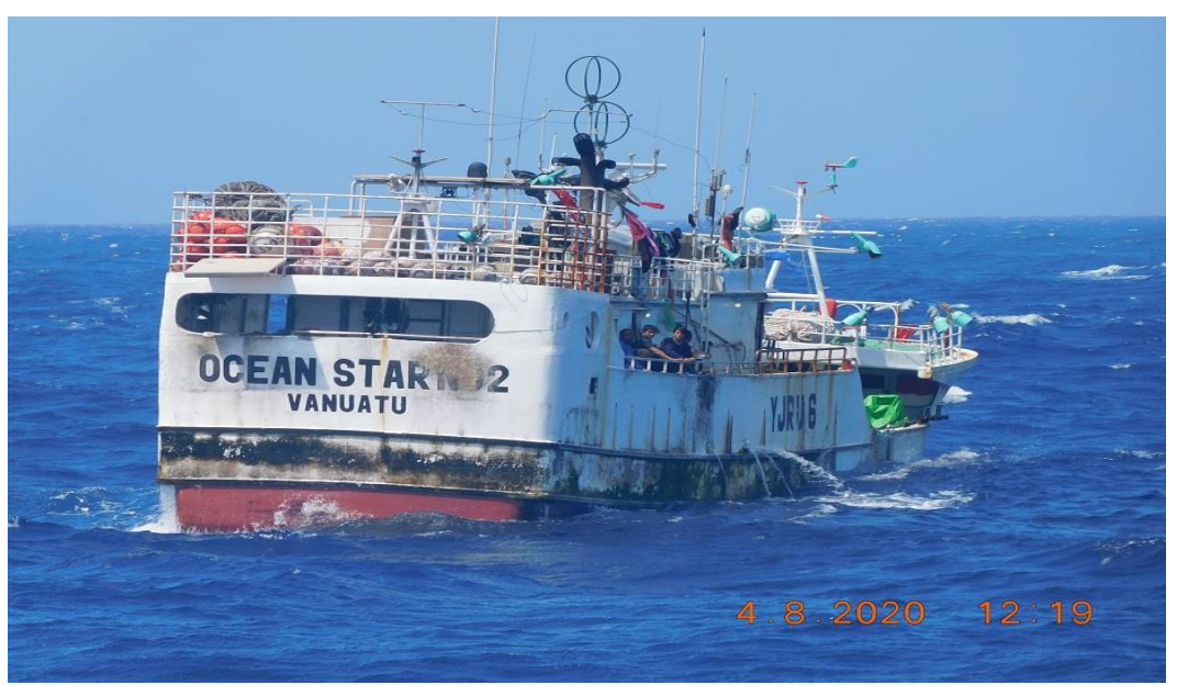
Figure (C) USCG Photograph of FV OCEAN STAR NO 2 during the patrol 8 April 2020. The red circle highlights the name of the vessel and flag State painted on the vessel's stern.