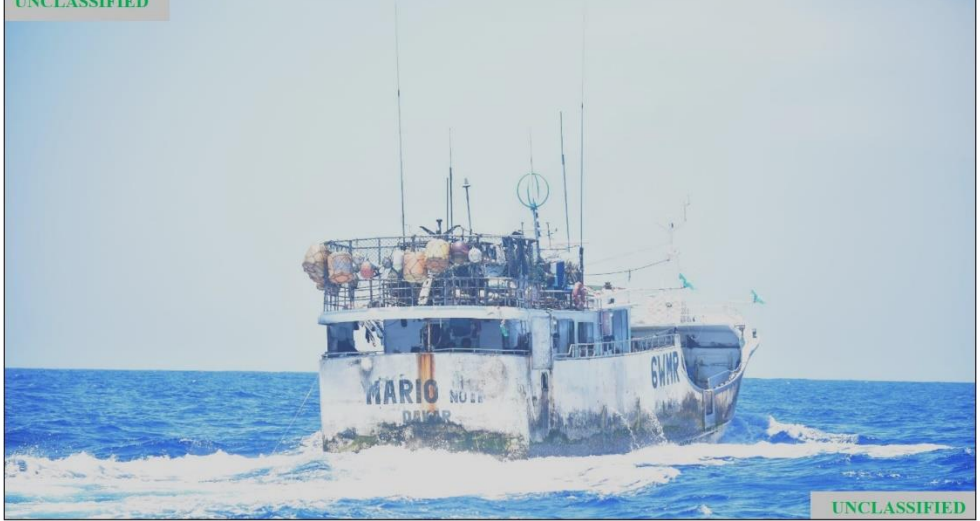
Figure (B) Photograph of FV MARIO NO 11 during the patrol on 6 May 2020.