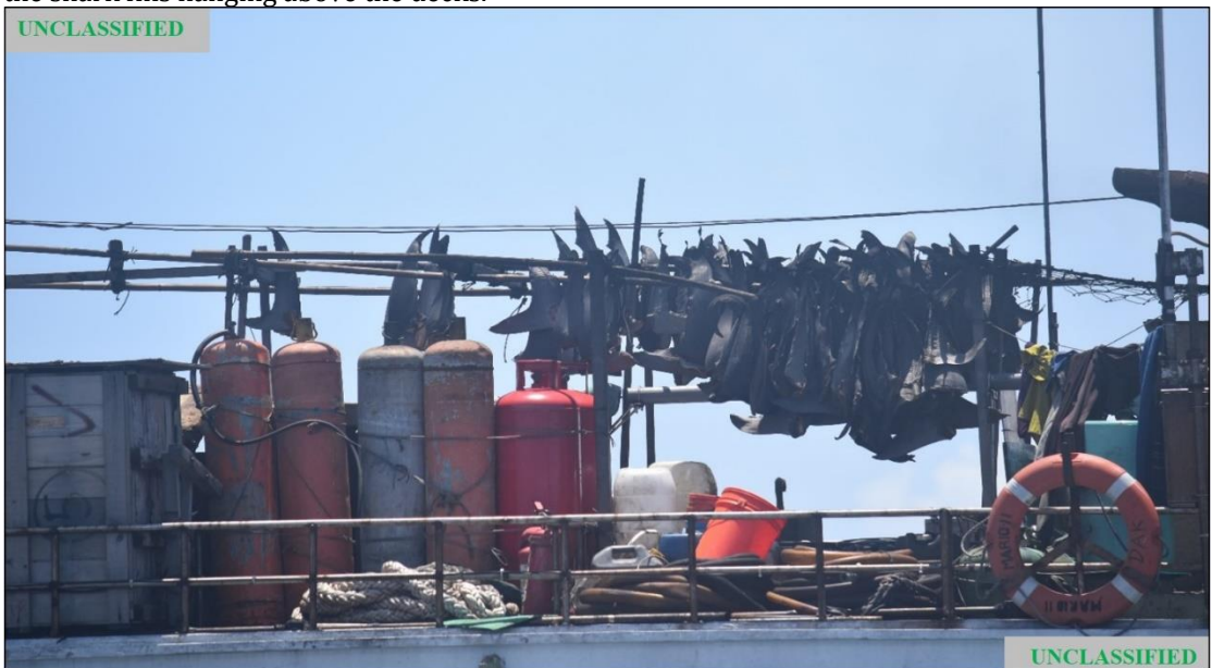
Figure (D) USCG Photograph of FV MARIO NO 11 during the patrol 6 May 2020 showing a close up of the shark fins hanging above the deck.