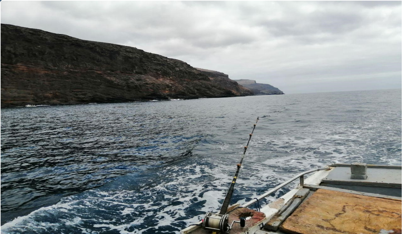
Trolling for tropical tuna off the coast of St. Helena island in November 2019.

Overview: The AOTTP Programme ( http://www.iccat.int/AOTTP/en/ ) is collecting tag recapture data from tropical tuna fisheries in the Atlantic Ocean to improve their management.