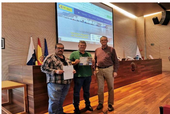
AOTTP Lottery Prize presentation in the Canary Islands.