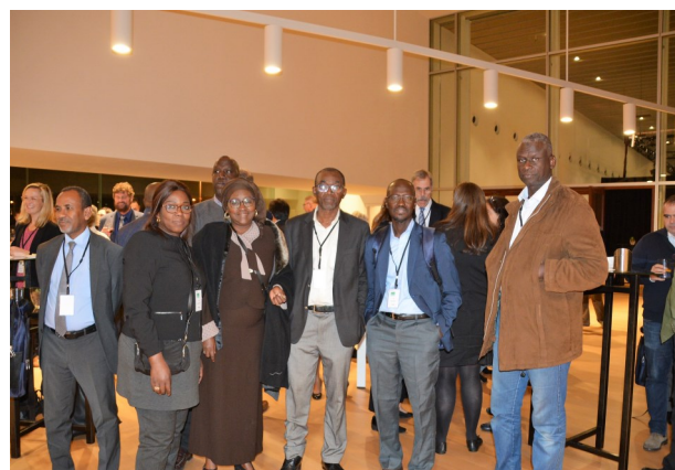
Participants at AOTTP Side Event.