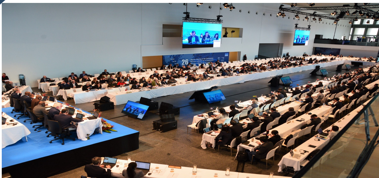
The 26th Meeting of the ICCAT Commission (Palma, Mallorca, November 2019).