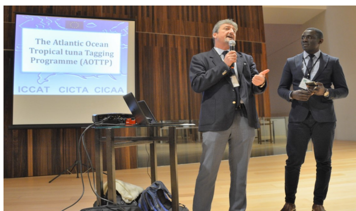
Presenting AOTTP at the Side Event.