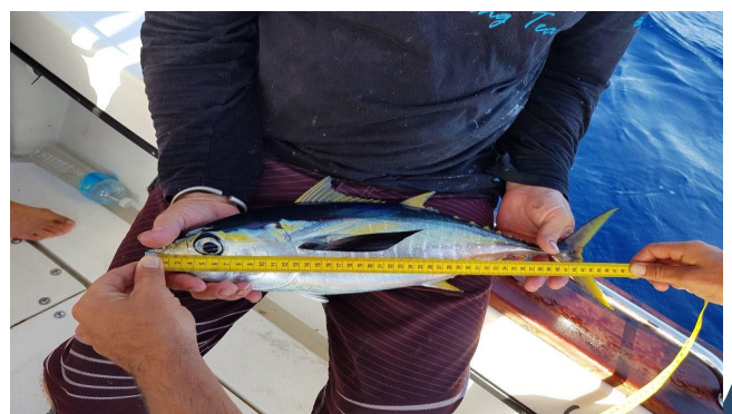
Recreational fishers tagging for AOTTP off Guadeloupe in November 2019.