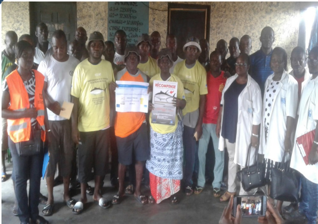
ICCAT-AOTTP lottery winner in Abidjan.

Tag recovery: More than 15,000 tags have now been recovered in the Atlantic. To incentivise tag-finders ICCAT organises an annual lottery with substantial prizes of 500 euros offered. All tags recovered during the previous year on any ICCAT tagging programme are entered into the competition and there is a category for each species. The draw is held at the SCRS Plenary meeting each year usually in late September. This year's winners came from Senegal and Côte d'Ivoire.