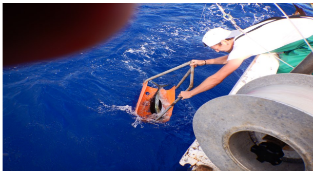
Landing cradle with yellowfin off St Helena, January 2019

Overview: The AOTTP Programme ( http://www.iccat.int/AOTTP/en/ ) is collecting tag recapture data from tropical tuna fisheries in the Atlantic Ocean to improve their management.