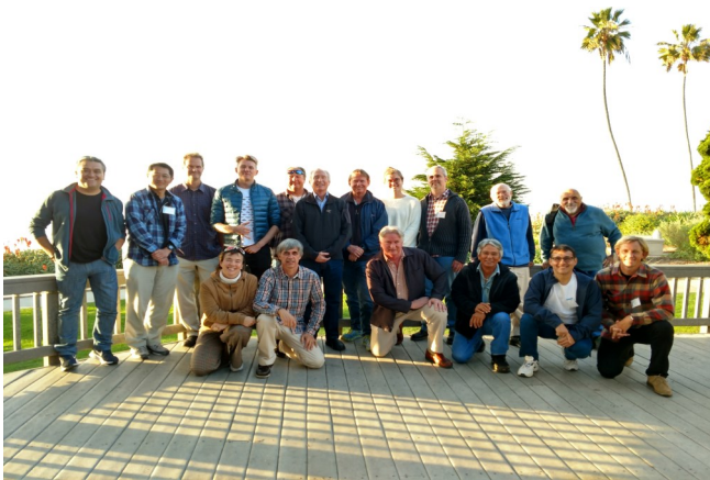
IATTC Regional Tagging Programme Review of Proposed Activities, La Jolla. 28-30 January 2019.

Yellowfin Stock Assessment: The ICCAT Standing Committee on Research and Statistics (SCRS) will assess the yellowfin stock in the Atlantic this year. AOTTP data will inform the stock assessment process, providing new estimates of mortality, movement/migration and growth. AOTTP coordination will prepare and present the available data for yellowfin to the SCRS prior to the Data Preparation meeting planned for late April, while the stock assessment itself will take place in July.