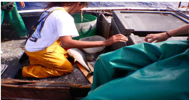
Tagging yellowfin off St Helena, January 2019

Overview: The AOTTP Programme ( http://www.iccat.int/AOTTP/en/ ) is collecting tag recapture data from tropical tuna fisheries in the Atlantic Ocean to improve their management.