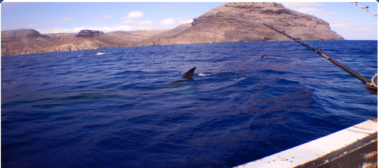
Fishing for tropical tuna on board John Melliss off St Helena with whaleshark for company, January 2019.