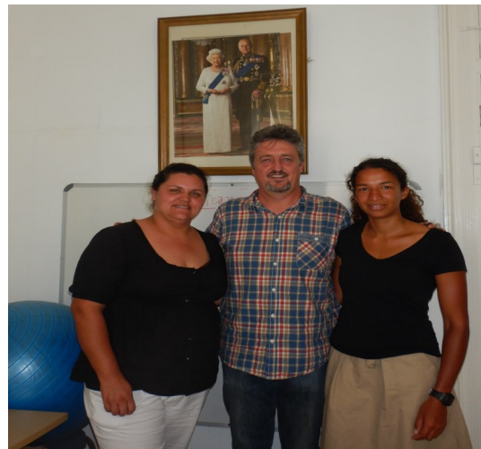
Tagging and Blue Belt Program Coordination team in St Helena.

AOTTP has been cooperating with the Blue Belt Programme which is also tagging tropical tuna in the Atlantic around British Overseas Territories. A number of Blue Belt tags from fish tagged at the seamounts around St Helena have already been reported by AOTTP tag-recovery offices in West Africa. Data from both programmes are shared and stored in ICCAT databases.