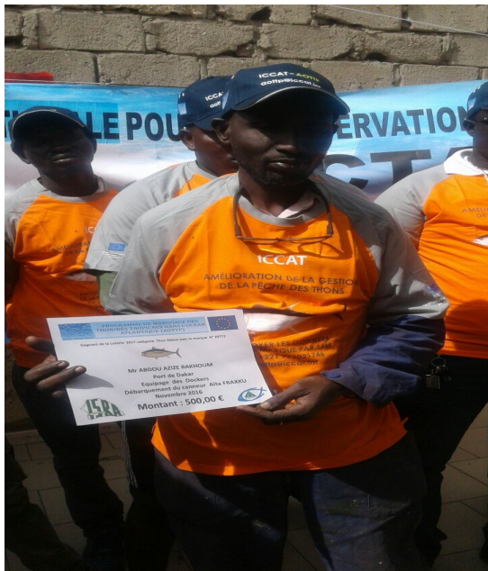
ICCAT-AOTTP Lottery winner in Dakar.

Tag recovery: More than 15,000 tags have now been recovered in the Atlantic. To incentivise tag-finders ICCAT organises an annual lottery with substantial prizes of 500 euros offered. All tags recovered during the previous year on any ICCAT tagging programme are entered into the competition and there is a category for each species. The draw is held at the SCRS Plenary meeting each year usually in late September. This year's winners came from Senegal and Côte d'Ivoire.