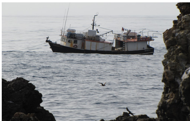
The Transmar I tagging tuna around the São Pedro and São Paulo Archipelago.

Tag recovery: Since we last wrote, 500 additional tags have been found with the total now at just over 11,500. Tag-recovery rates have slowed down gradually since tagging in the core fishing grounds off West Africa stopped at the end of March 2016.