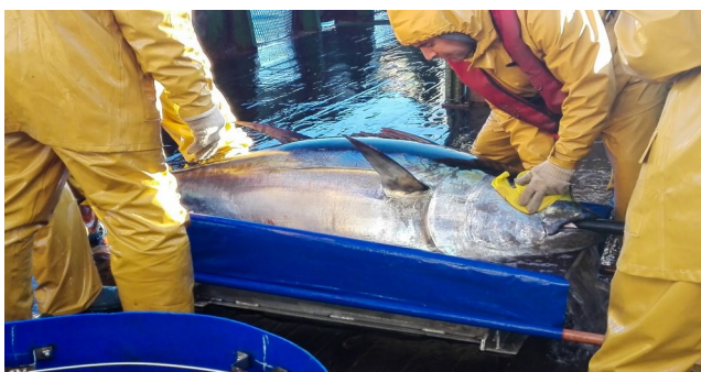
Tagging large tuna off Uruguay.

Overall 64,500 tuna (53% of the target) have now been tagged and released in the Atlantic Ocean by AOTTP.