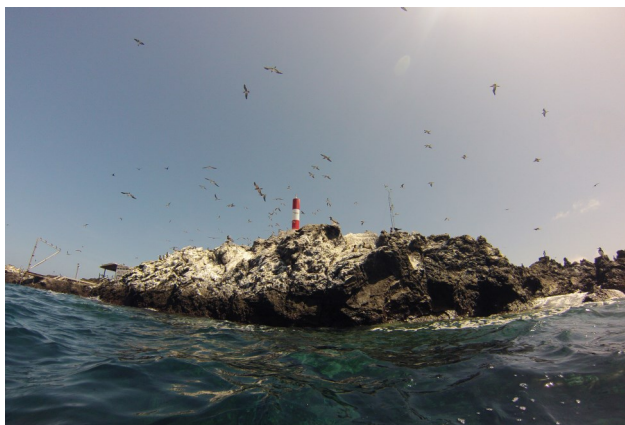
The Saint Peter and Saint Paul Archipelago: 15 islets and rocks in the central Atlantic approximately 510nmi (940km) from the nearest point of mainland South America (the town of Touros, Brazil).