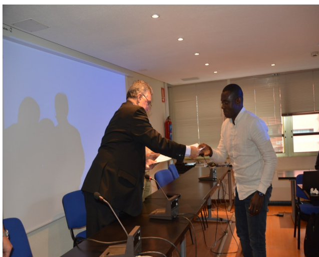
ICCAT Executive Secretary presenting Attendance Certificates to participants during AOTTP Workshop 1 in Madrid.

The state of the population of bigeye tuna will be assessed in 2018 by ICCAT. Knowledge gained during the workshops will be a launchpad for increased involvement by ICCAT developing country partners.