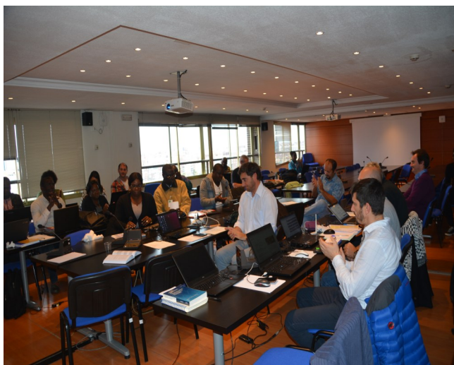
AOTTP Workshop 1: Introduction, access and use of ICCAT -AOTTP conventional tagging databases.

A second AOTTP workshop was organised in Abidjan between 15th and 19th January 2018. The focus this time was on growth and mortality estimation from the tag-recapture data. A third workshop studying tuna movement will be held in Madrid in April 2018.