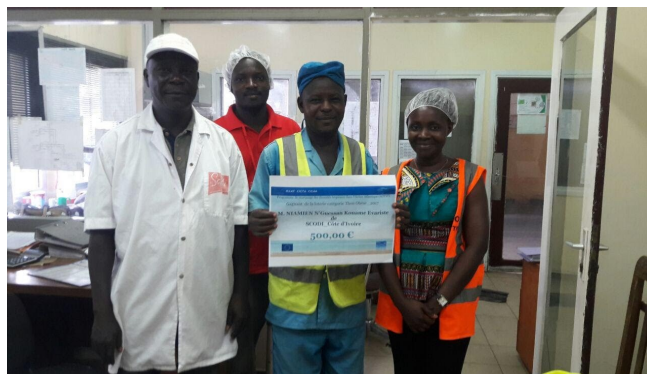
Lottery winner receiving cash prize in Abidjan, Côte d'Ivoire.

AOTTP tag recovery and awareness raising activities are expanding to the Far-East where Atlantic tuna are often taken for processing. Colleagues in Japan have recently translated AOTTP posters into Japanese.