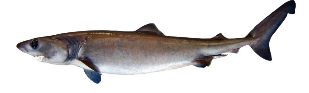
Figure 1. Crocodile shark (Pseudocarcharias kamoharai) (Matsubara, 1936).

Characteristics of Pseudocarcharias kamoharai (see Figure 1).