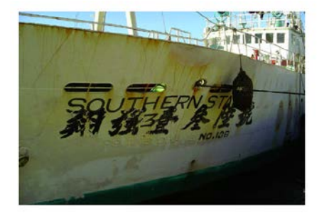
Photo available for IUU vessel with Serial number: 20050001. See below:

Photos available from IOTC for IUU vessels with Serial numbers: 20100004, 20130003, 20130004, 20150014, 20150024, 20150026, 20150033, 20150042, 20150043, 20150044, 20150046, 20150047, 20170013, 20170016, 20170017, 20180001, 20180002, 20180003, 20180004, 20180005, and, 20190002. See the reference documents in: https://www.iotc.org/vessels#iuu