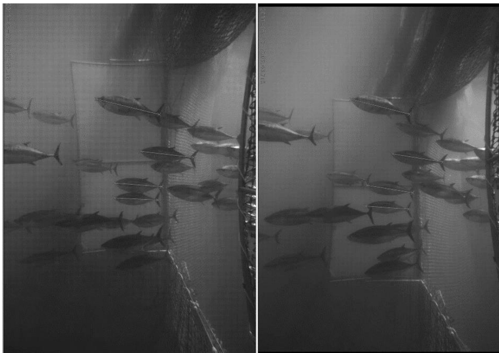
Figure 3. Example of good quality image: Disaggregated fish passing slowly at appropriate distance through net opening limited by rigid frame (4x4.5 m) with white panel in background for better contrast; many fish can be measured; accurate estimation of number of fish counted.