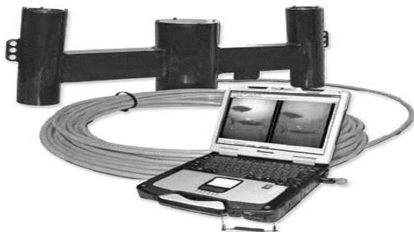
Figure 1. Stereoscopic camera system, AQ 100.