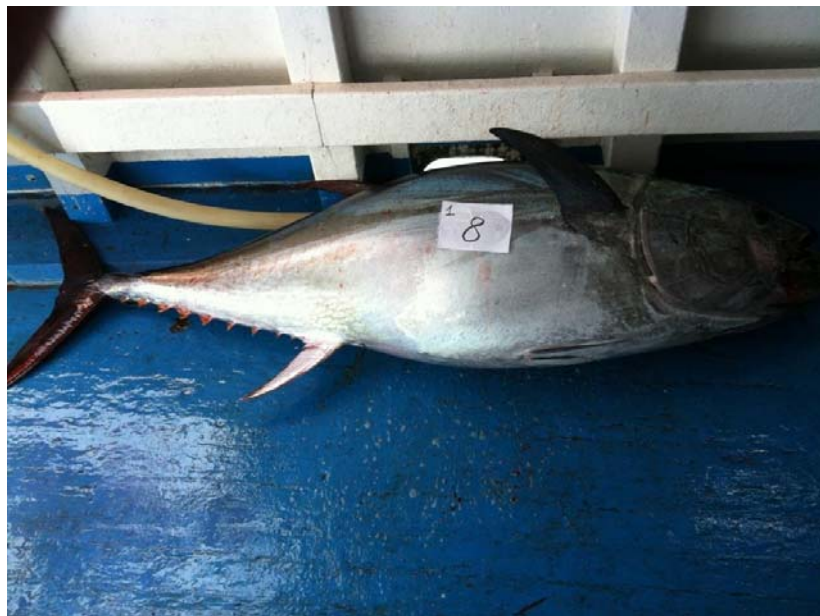
Figure 1. Bluefin tuna with swollen abdomen and in pre-reproductive physiological condition.