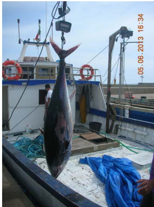
Figure 3. Operations weighing whole tuna.