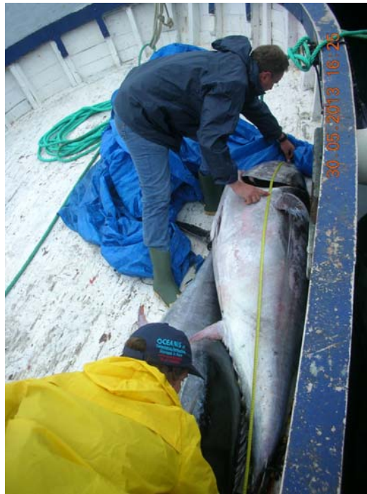
Figure 2. Measurement of the length curve to the fork.