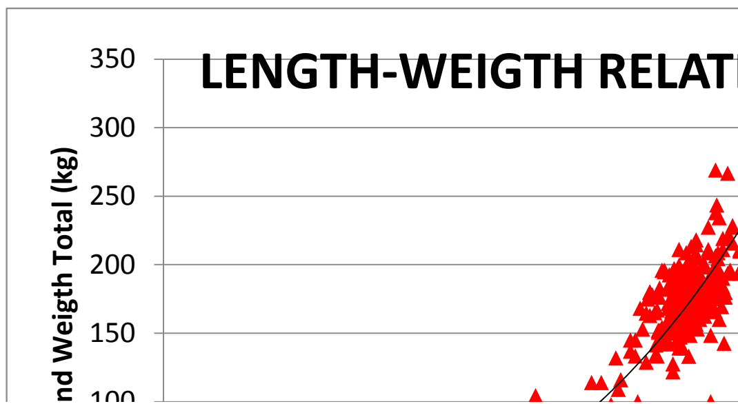
Figure 4. Trend line correlation curved fork lengths/weights (weights are in kg and lengths are in cm).