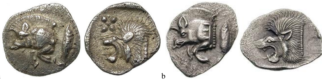
Figure 6a (left). Hemiobol, Greek coin in silver from Cyzicus, c. 450 b.C. (0.36 g); obverse: forepart of boar running left, tunny fish upwards behind; reverse: head of roaring lion left, star of four rays above. Figure 6b (right). Trihemioobol, Greek coin in silver from Cyzicus, c. 480 b.C. (0.82 g); forepart of boar running left, tunny fish upwards behind; reverse: head of roaring lion left.