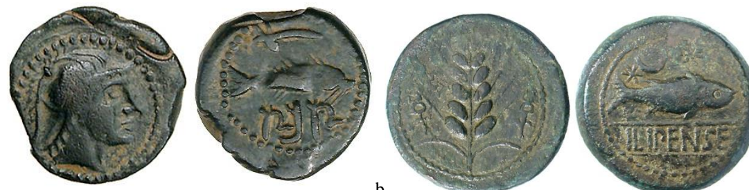
a b Figure 16a (left). Semis, Phoenician Punic coin in bronze from Sexsi, c. 200 b.C. (4.4 g); obverse: helmet male head right; reverse: Tuna-fish right, Phoenician letter "aleph" above, neo-Punic inscription SKS below. Figure 16b (right): As, Iberian coin in bronze from Ilipense, c. 200 b.C. (35 g); obverse: grain ear; reverse: Tuna-fish swimming right, crescent above between two stars, legend "ILIPENSE" below.