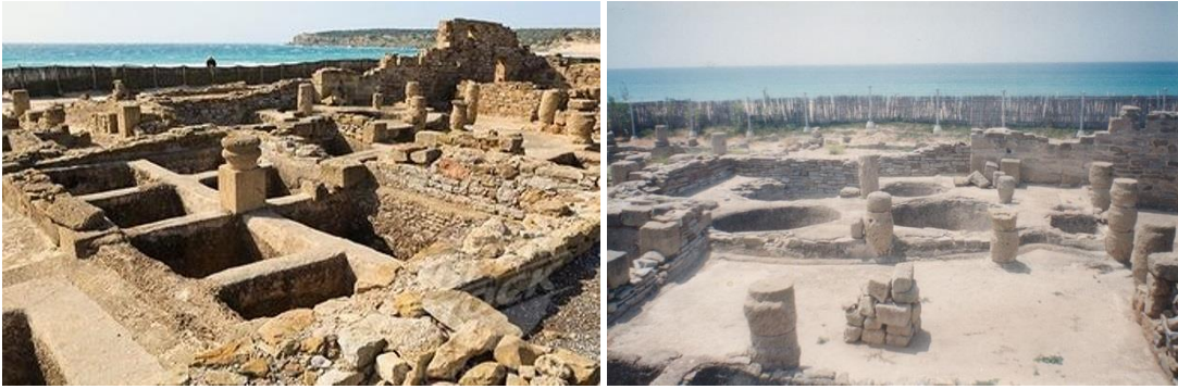
Figure 2. Fish salting factory in Baelo Claudia (South Spain).