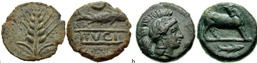
a Figure 19a (left). Quadrans – Quarter unit, Phoenician Punic coin in bronze from Ituci, I b.C.; obverse: grain ear; reverse: legend ITUCI, tuna right, crescent above. Figure 19b (right): unknown Greek coin unit from Thurium, IV b.C.; obverse: helmeted bust of Athena right; reverse: Bull right, head reverted; tuna fish right in exergue.