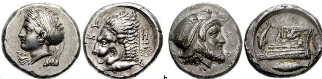
a Figure 21a (left). Tetrachm, Phoenician Punic coin in silver from Cyzicus, 350 b.C. (15.21 g); obverse: ΣΩΤΕΙΡΑ, Head of Kore Soteira left, hair in sakkos; reverse: legend KI-ZI, Head of lion left, tuna fish left below; wreath behind. Figure 21b (right): Tetrachm, Phoenician Punic coin in silver from Cyzicus, 413 b.C. (14.67 g); obverse: ΦΑΡ-Ν-[Α]-ΒΑ, head of Pharnabazos right, wearing satrapal cap tied below his chin, and diadem; reverse: Ornate ship's prow left, decorated with a griffin and prophylactic eye; before and aft, two dolphins downward; below, tuna left.