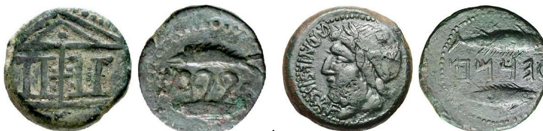
a b Figure 17a (left). As, Phoenician Punic coin in bronze from Abdera, II b.C.; obverse: Tetrastyle 5 temple; reverse: Punic inscription BDRT, two tuna fish left. Figure 17b (right): As, Phoenician Punic coin in bronze from Salacia - Ketouibon, c. 150 b.C. (13.53 g); obverse: inscription CAVONIE SIS CRA, laureate bearded head facing to left, dotted border; reverse: two tunas swimming right.