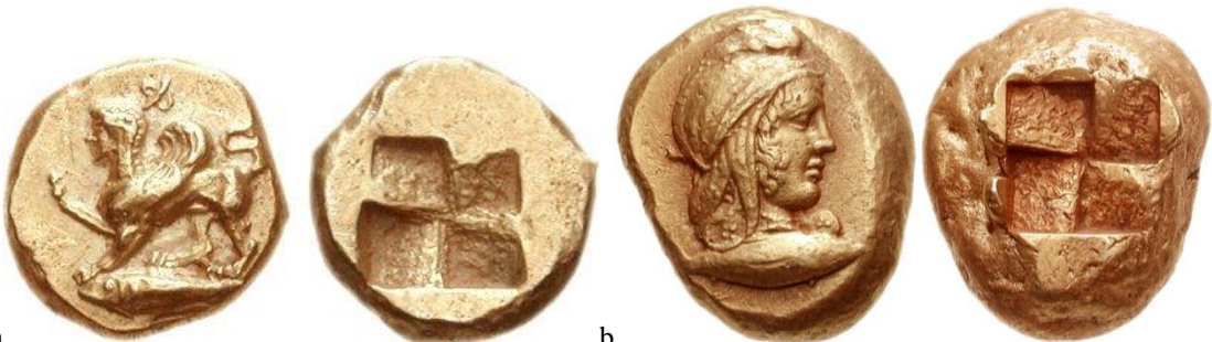
Figure 13a (left). El Hekte, Greek coin in fourrée from Cyzicus, c.500 b.C. (2.01 g); obverse: Sphinx standing left; below, tuna left; reverse: quadripartite incuse square. Figure 13b (right): El Hekte, Greek coin in electrum from Cyzicus, V b.C. (16.7 g); obverse: Head of Attis right, wearing Phrygian headdress; below, tuna right; reverse: quadripartite incuse square.