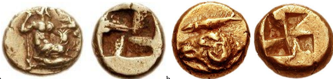
Figure 8a (left). El 1/24 Stater, Greek coin in electrum from Cyzicus, V b.C. (0.69 g); obverse: Zeus AĒtophoros kneeling right on tunny right; reverse: incuse square with swastica. Figure 8b (right). El 1/12 Stater, Greek coin in electrum from Cyzicus, c. 500 b.C. (1.34 g); obverse: ram's head left, tuna above; reverse: quadripartite incuse square with swastica.