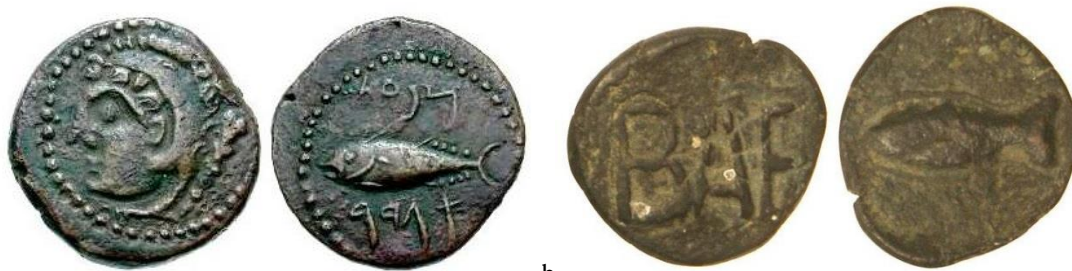
a b Figure 15a (left). Semis, Phoenician Punic coin in bronze from Gadir, II b.C.; obverse: Head of Melkart-Herakles left, wearing lion's skin headdress; club on left shoulder; reverse: Tuna left, Phoenician script MP'L above and 'GDR' below. Figure 15b (right): Semis, Iberian coin in bronze from Baesuri, II b.C. (2.2 g); obverse: inscription BAE; reverse: Tuna-fish left.