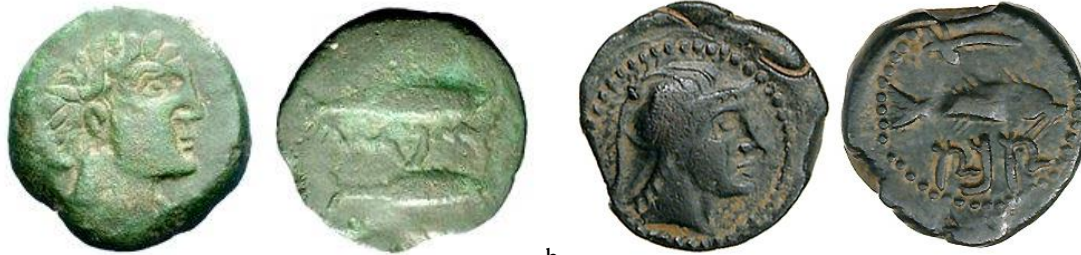
a b Figure 14a (left). Double AE, neo-Punic Phoenician coin in bronze from Sexis, II b.C.; obverse: Melkart head right, club on left shoulder; reverse: two tunas right, SKS inscription. Figure 14b (right): Semis, neo-Punic Phoenician coin in bronze from Sexis, c. 200 b.C. (4.4 g); obverse: Helmet male head right; reverse: Tuna-fish right, Phoenician letter 'aleph' above.