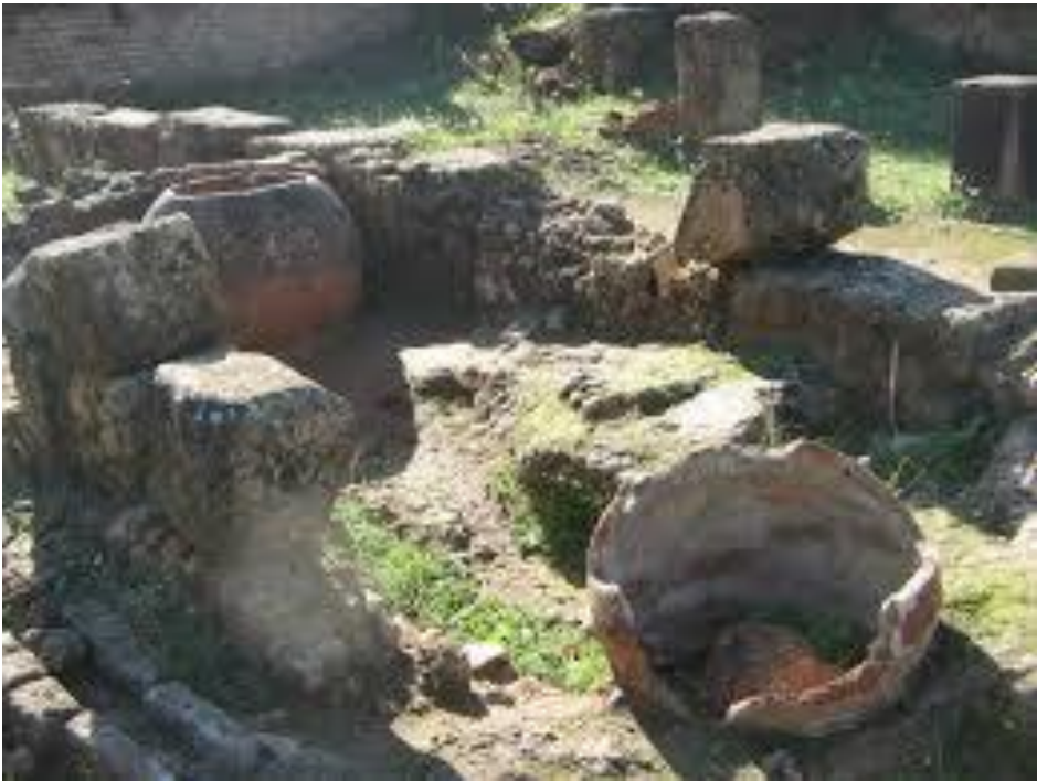
Figure 4. Fish salting factory in Tipaza (Algeria).