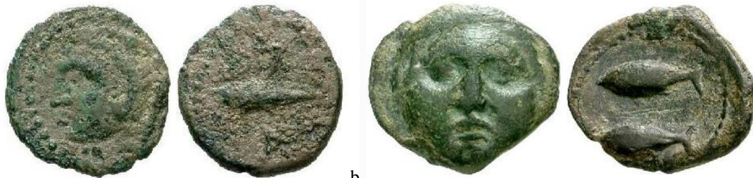
a Figure 18a (left). Sextants (?), Phoenician Punic coin in bronze from Gadira, I b.C.; obverse: Head of Melkart-Herakles left, wearing lion's skin; reverse: tuna left, Phoenician letter "aleph" below. Figure 18b (right): Quadrans – Quarter unit, Phoenician Punic coin in bronze from Gadira, 237 b.C.; obverse: Helios head facing; reverse: Phoenician script MP'L above and 'GDR below, Phoenician letter 'aleph' between two tuna-fish right.