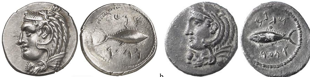
a Figure 20a (left). Hemidrachm, Phoenician Punic coin in silver from Gadira, 237 b.C. (2.36 g); obverse: Head of Melkart-Herakles left, wearing lion's skin headdress; club on left shoulder; reverse: tuna-fish left Phoenician script MP'L above and 'GDR below. Figure 20b (right): Drachm, Phoenician Punic coin in silver from Gadira, III b.C. (3.3 g); obverse: Head of Melkart-Herakles left, wearing lion's skin headdress; club on left shoulder; reverse: tuna-fish left Phoenician script MP'L above and 'GDR below.