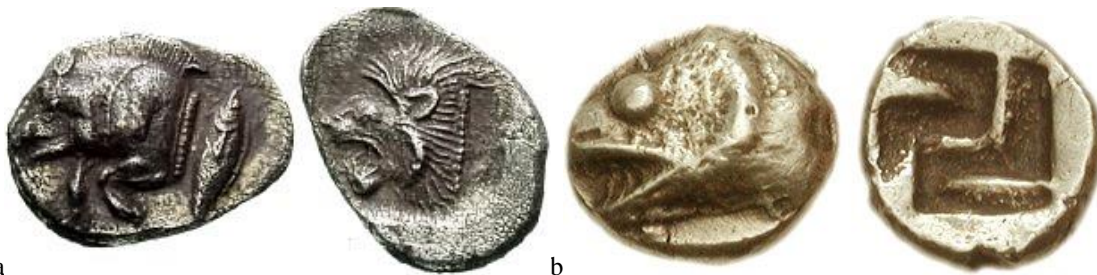
Figure 7a (left). Obol, Greek coin in silver from Cyzicus, c. 480 b.C. (0.80 g); obverse: forepart of boar running left, tunny fish upwards behind; reverse: head of roaring lion left, with incuse square. Figure 7b (right). El 1/48 Stater, Greek coin in silver from Cyzicus, c. 600 b.C. (0.39 g); obverse: head of tuna right; reverse: incuse square with swastika.