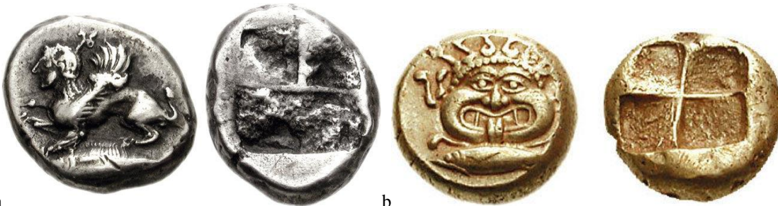
Figure 12a (left). El Hekte 1/6 Stater, Greek coin in fourrée from Cyzicus, c.500 b.C. (2.01 g); obverse: Sphinx standing left; below, tuna left; reverse: quadripartite incuse punch. Figure 12b (right): El Hekte, Greek coin in electrum from Cyzicus, c. 500 b.C. (2.67 g); obverse: Facing head of gorgoneion with protruding tongue, set on tuna left; reverse: quadripartite incuse square.