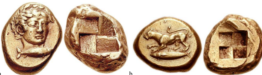
Figure 9a (left). El Stater, Greek coin in electrum from Cyzicus, c.500 b.C. (16.1 g); obverse: Head of Apollo, wearing laurel wreath, facing slightly right; below, tuna right; reverse: quadripartite incuse square. Figure 9b (right). El Stater, Greek coin in electrum from Cyzicus, c. 500 b.C. (16.23 g); obverse: Panther standing left on tuna, raising right forepaw; reverse: quadripartite incuse square.