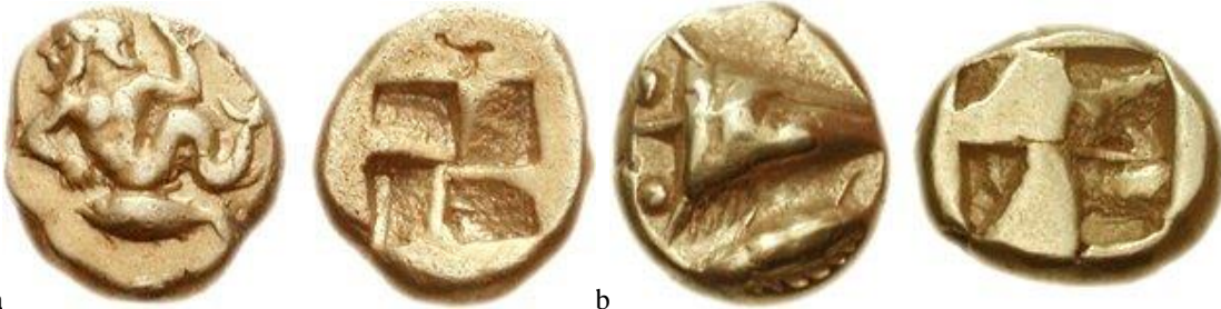
Figure 10a (left). El Hemihekte, Greek coin in electrum from Cyzicus, c.500 b.C. (1.3 g); obverse: Triton left holding wreath in left hand, on tuna left; reverse: quadripartite incuse square. Figure 10b (right): El Hemihekte, Greek coin in electrum from Cyzicus, c. 600 b.C. (1.33 g); obverse: Panther standing left on tuna, raising right forepaw; reverse: quadripartite incuse square.