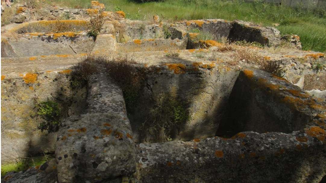
Figure 3. Fish salting factory in Lixus (Atlantic coast of Morocco).