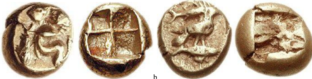
Figure 11a (left). El Hemihekte 1/12 Stater, Greek coin in electrum from Cyzicus, c.550 b.C. (1.33 g); obverse: Triton(?) left, holding tuna; head of tuna to left; reverse: quadripartite incuse square. Figure 11b (right): El Hekte 1/6 Stater, Greek coin in electrum from Cyzicus, c. 600 b.C. (2.71 g); obverse: Eagle standing right on tuna left; to upper left, tuna right; reverse: quadripartite incuse punch.